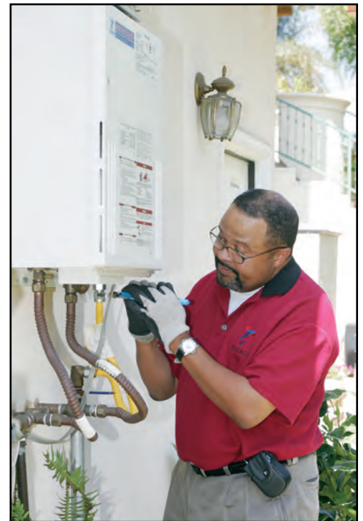
Takagi Tankless Flash Water Heater

Imagine having an endless supply of hot water for showers or laundry while saving money at the same time! The tankless water heater, popular for years in Europe and Japan, but relatively new here, can provide just that. Takagi-USA's T-M1 Flash Water Heater (shown) is about the size of a suitcase and can be installed in tight spaces or even outside (in warmer climates). This device never runs out of hot water because it begins heating only when the tap is turned on and then heats the water continuously as it flows through the unit. When the water is turned off, the unit shuts down automatically. There is no storage tank needed to keep the water supply hot all day and night, even when it's not being used. That saves energy and reduces your utility costs. The life expectancy of these units is 20 years or more, compared with tank water heaters that last 10 to 15 years. Tankless water heaters are available in propane (LP), natural gas and electric models, in a variety of sizes to meet your household needs. ■